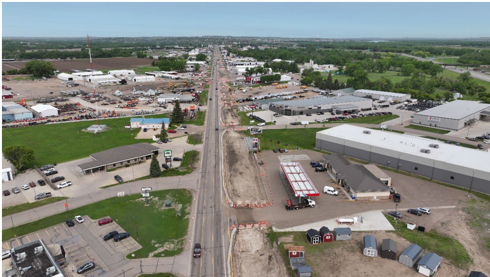
Aerial photo of construction progress, taken in May 2025.

Please note that weather conditions and ongoing construction activity may cause schedule changes. Thank you for your patience as work continues.